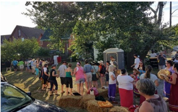
Schneider Creek Porch Party brought neighbours together around music, making it eligible for the Arts & Culture Award

Festival of Neighbourhoods applauds the great work of all those who bring neighbours together to build healthier, safer, and more fun neighbourhoods!