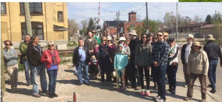
Mount Hope-Breithaupt reflected on its transformation from manufacturing to hi-tech industries on Jane's Walk, making it eligible for the Heritage Award