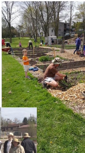
Mansion Greens brings neighbours together with this community garden, making it eligible for the Green Award.